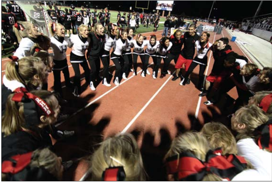
RHHS Cheerleaders and Hawk Guard raise the volume at last week's Homecoming game.